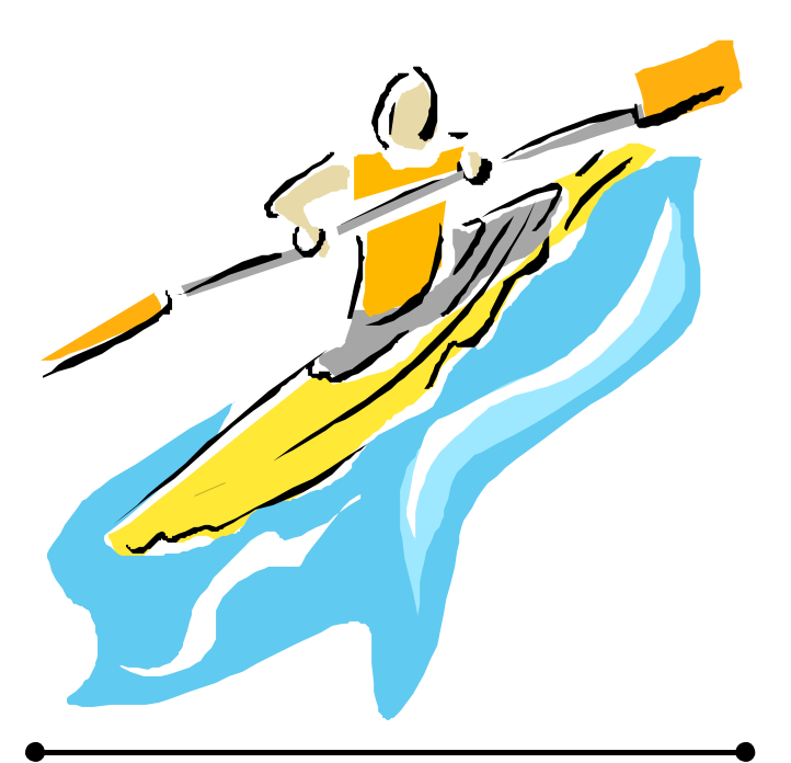
"..to start our 61st year in premises fit for the UK's biggest and best canoe club."

Richmond Canoe Club was founded on the 19th November 1944 at an inaugural meeting held in the Three Pigeons Public House adjacent to our current clubhouse. The club has occupied a number of premises on and around the current site over the last 60 years including an old landing craft, and has seen the present building both with and without a third storey. The opportunity has now arisen to acquire the freehold of the building in exchange for the sale of a long lease on a new penthouse flat to be built as a third storey to the building. Work is expected to start on the 5th January 2005, and a