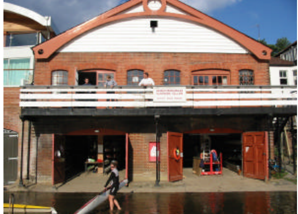
It'll soon be summer again, with those lazy Balcony Days.....

Responsible with enormous help from other experts in the club for ensuring that the transition and redevelopment of new clubhouse facilities proceeds as smoothly and with as little disruption to normal club life